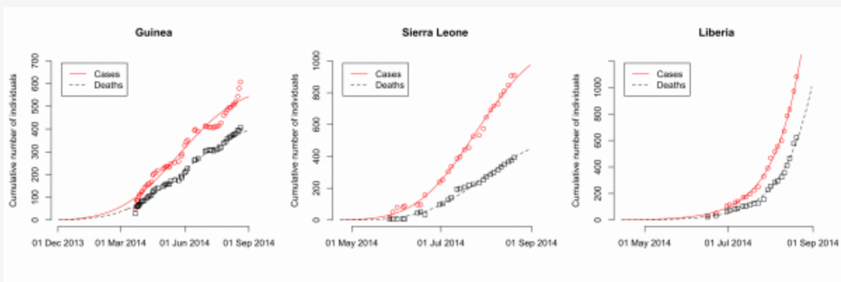
Fig. 1: Dynamics of 2014 EBOV outbreaks in Guinea, Sierra Leone and Liberia.

Data of the cumulative numbers of infected cases and deaths are shown as red circles and black squares, respectively. The lines represent the best-fit model to the data. Note that the scale of the axes differ between countries.